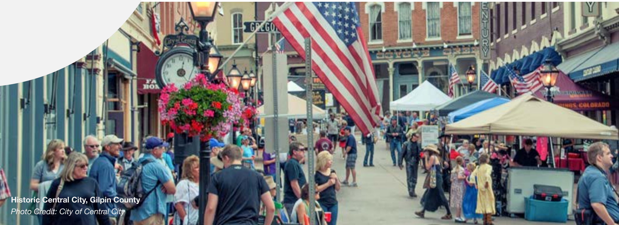
Historic Central City, Gilpin County

REGION 3: CLEAR CREEK AND GILPIN COUNTIES