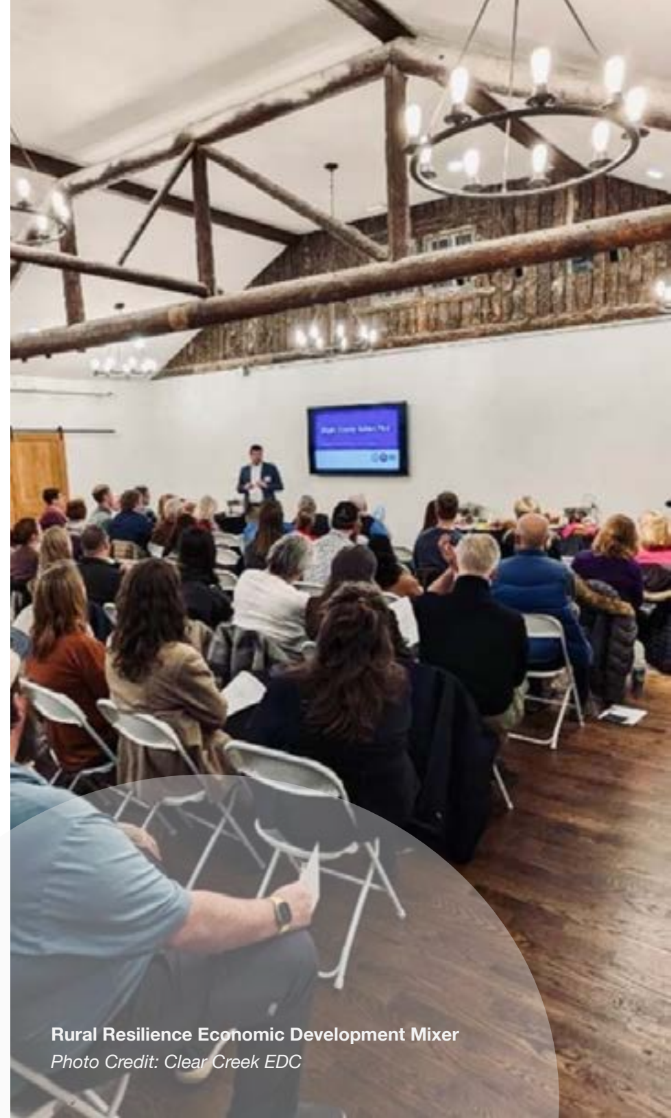
Rural Resilience Economic Development Mixer