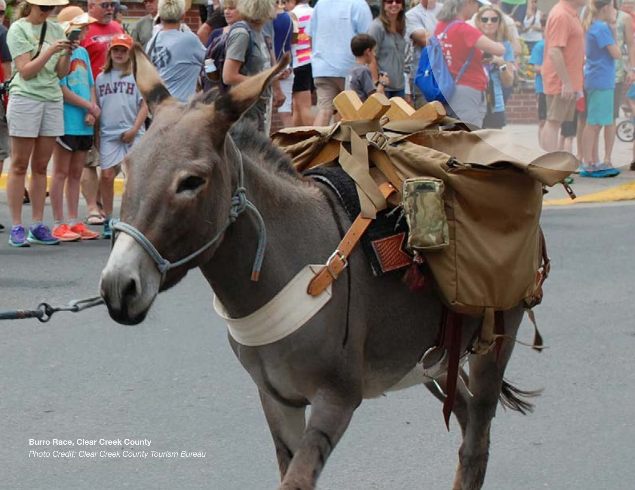
Burro Race, Clear Creek County