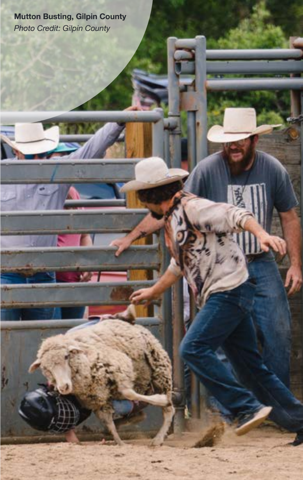
Mutton Busting, Gilpin County