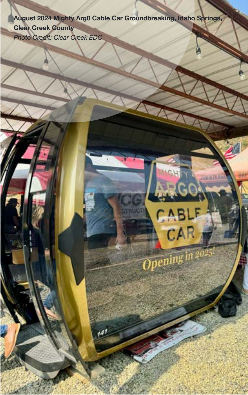
August 2024 Mighty Arg0 Cable Car Groundbreaking, Idaho Springs, Clear Creek County