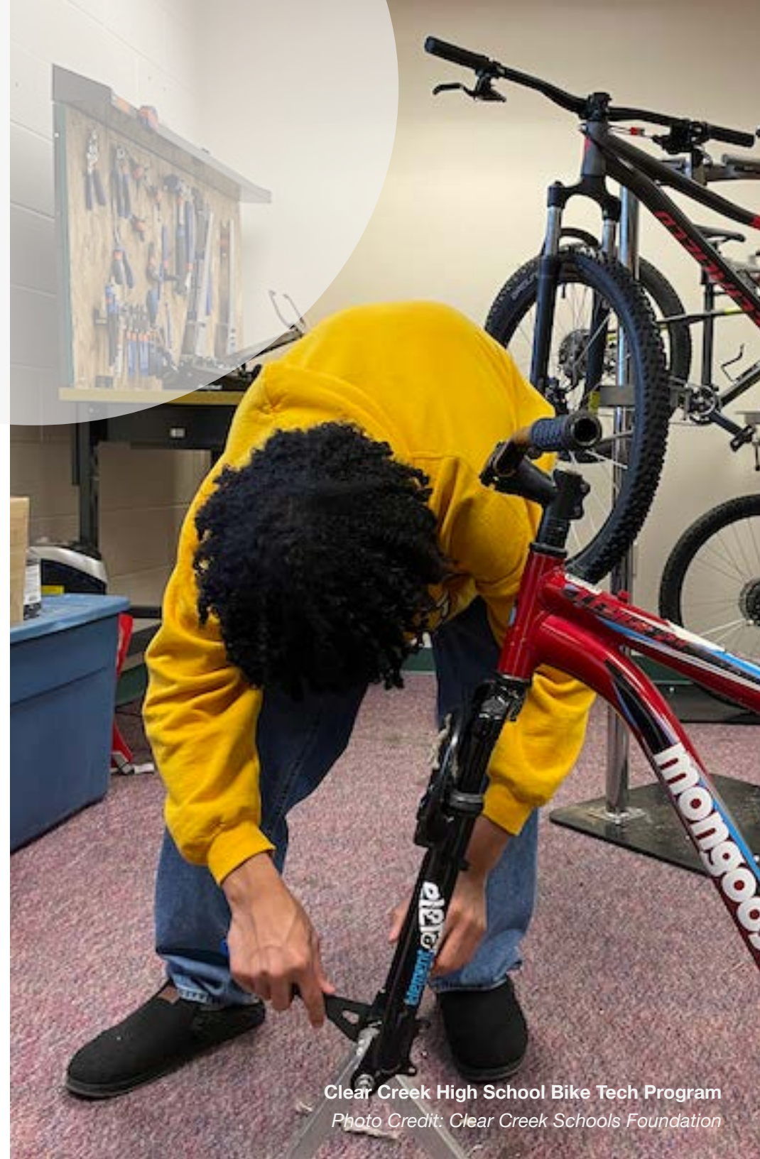
Clear Creek High School Bike Tech Program