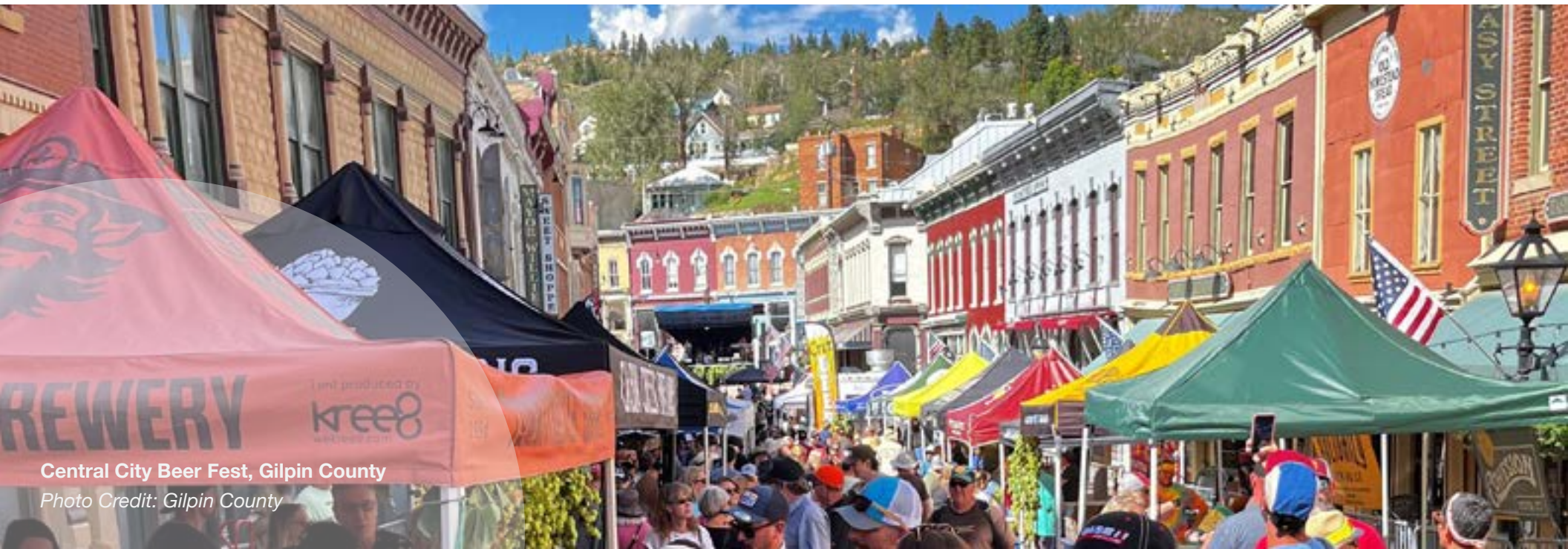
Central City Beer Fest, Gilpin County