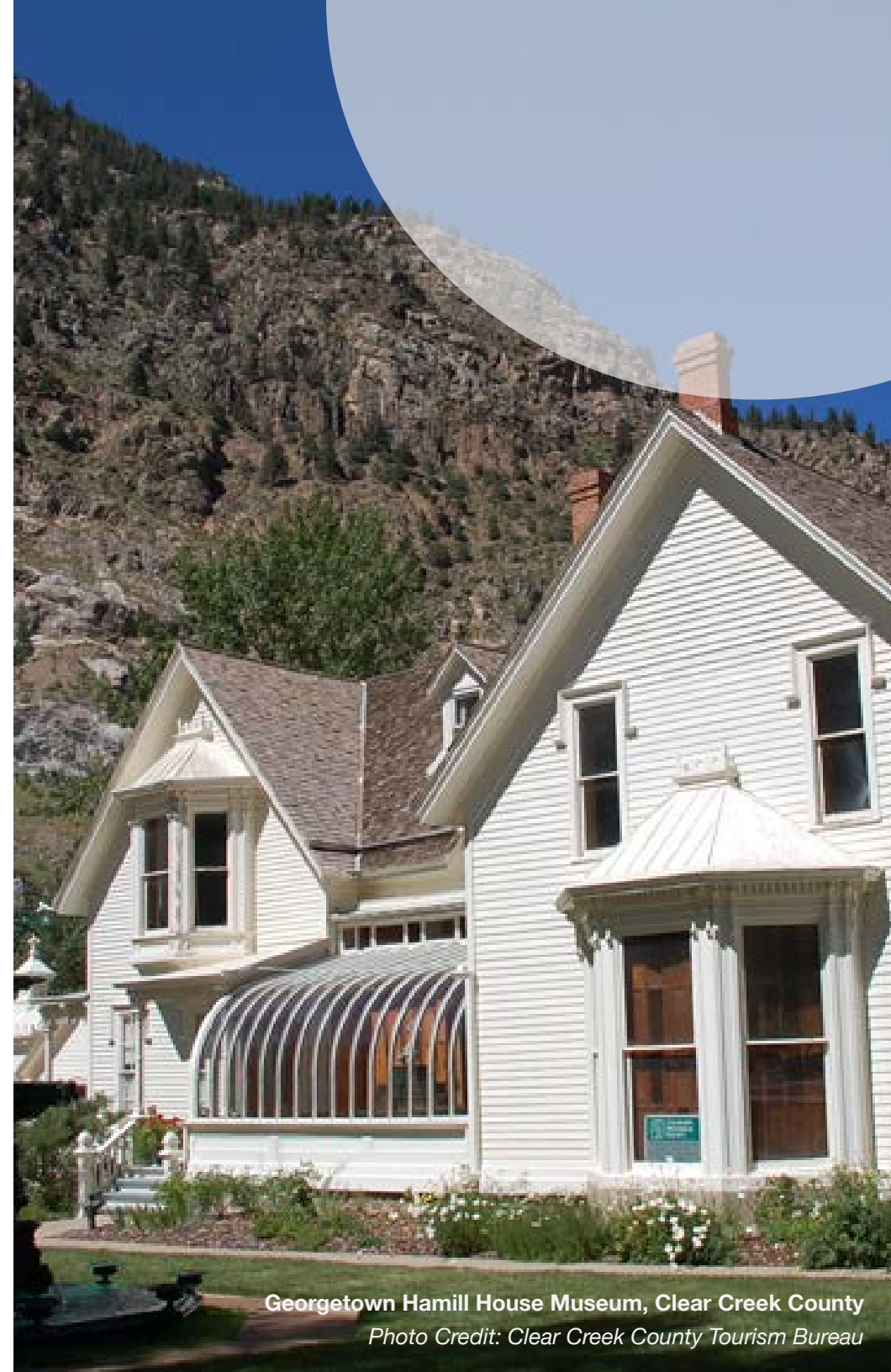
Georgetown Hamill House Museum, Clear Creek County