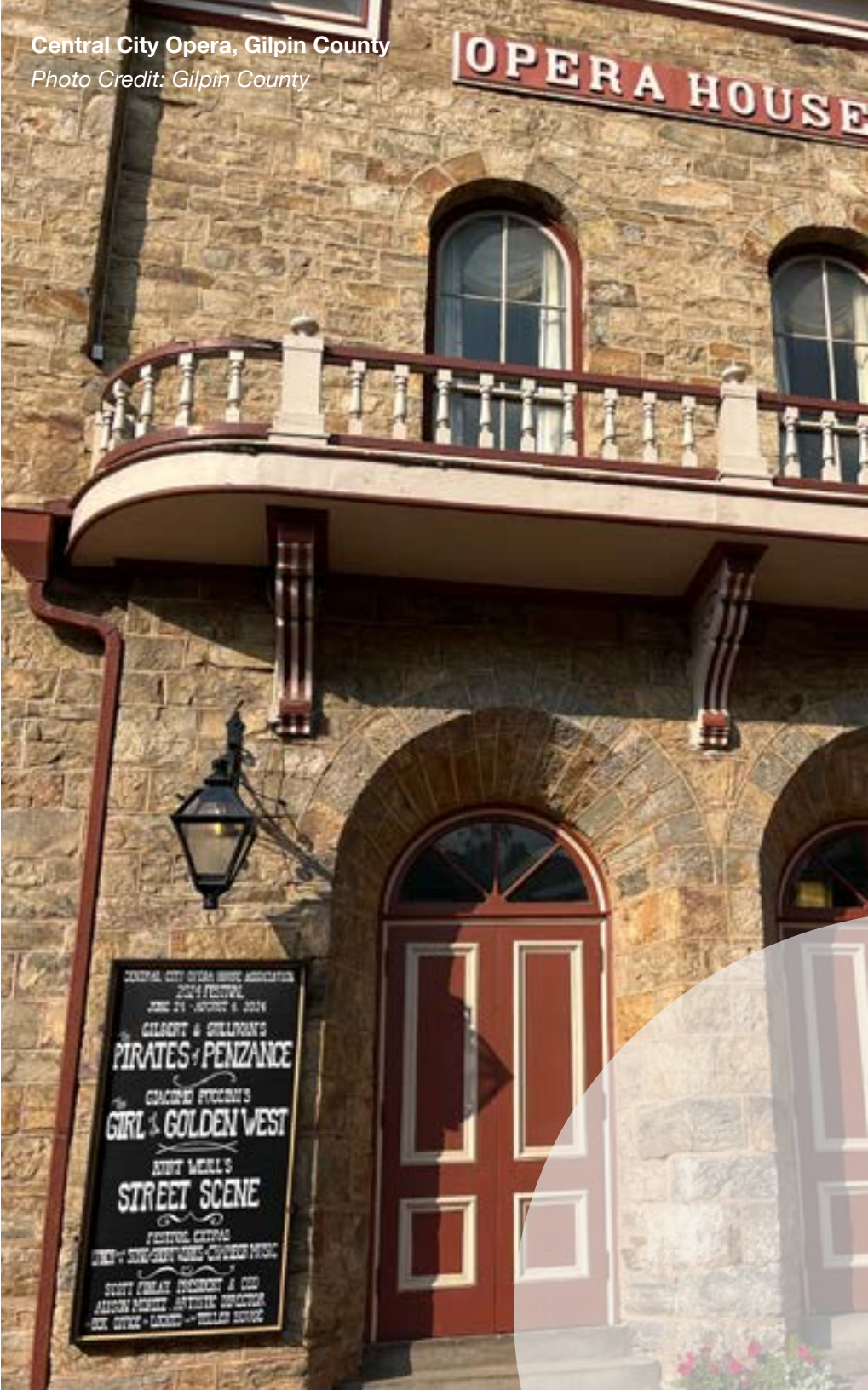
Central City Opera, Gilpin County