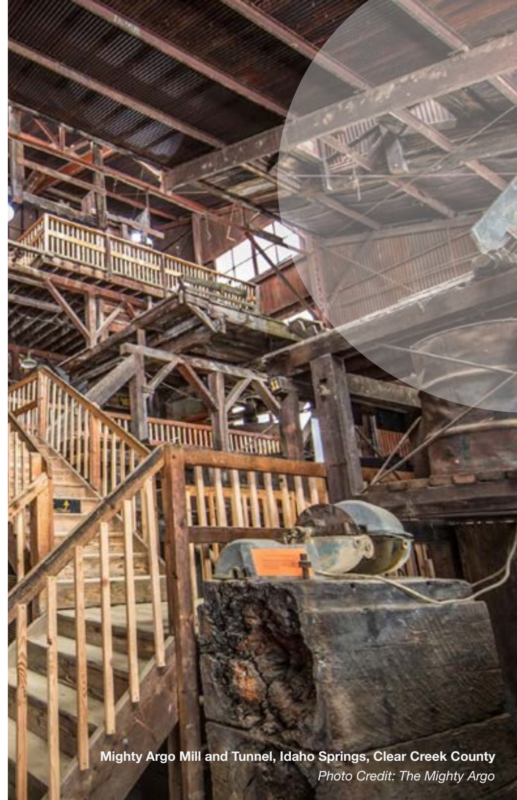
Mighty Argo Mill and Tunnel, Idaho Springs, Clear Creek County