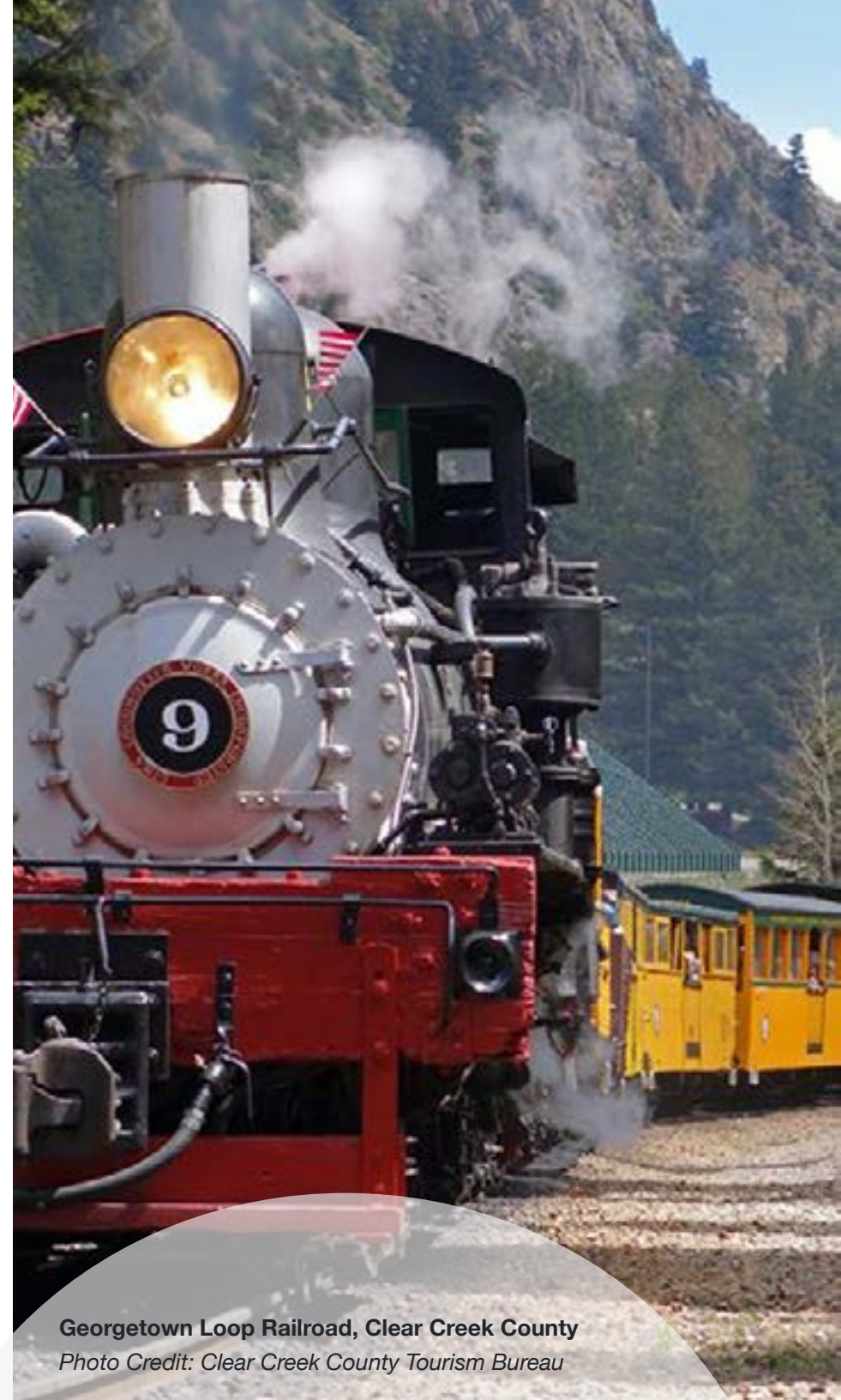
Georgetown Loop Railroad, Clear Creek County