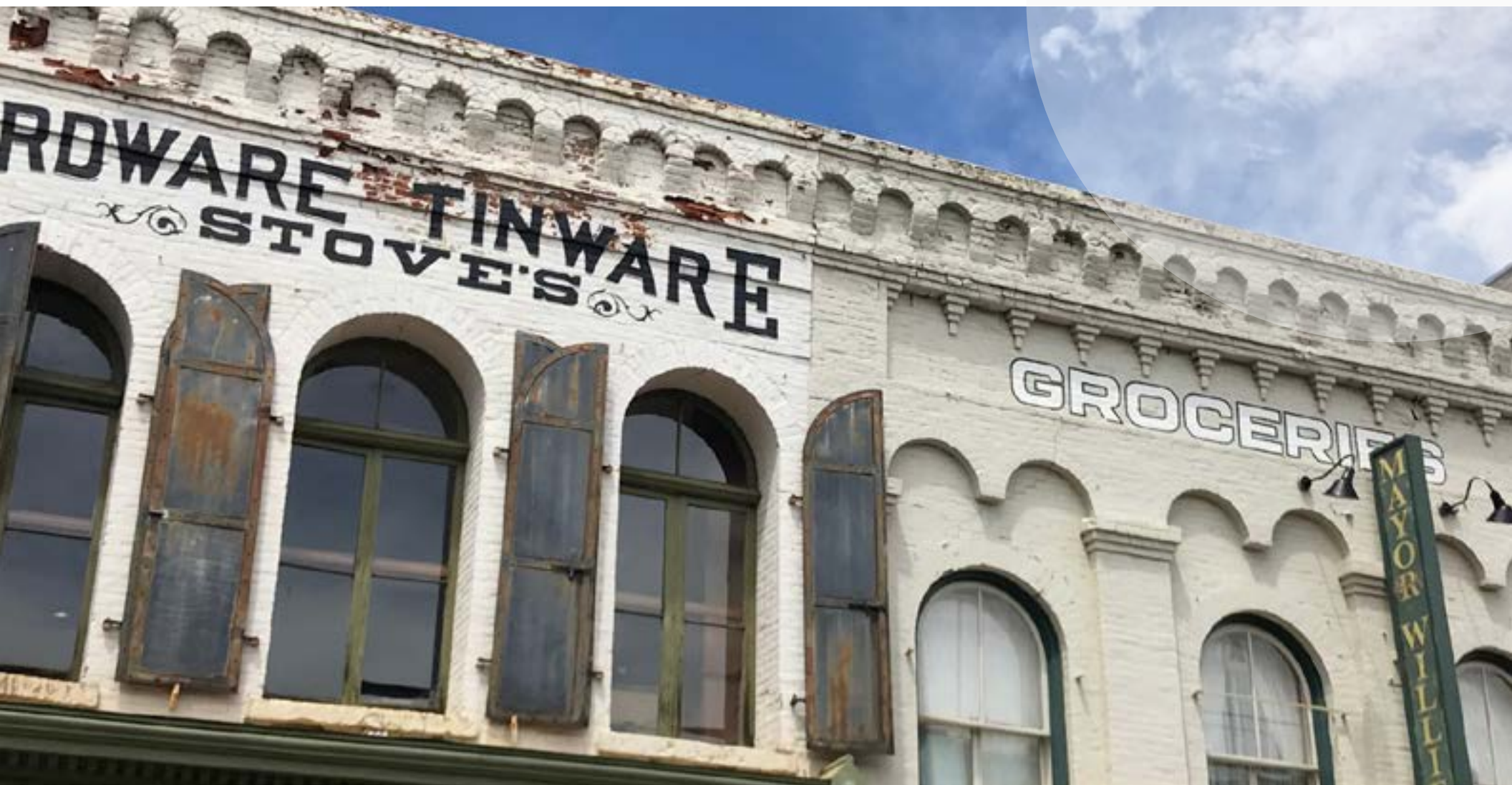
Historic Central City, Gilpin County