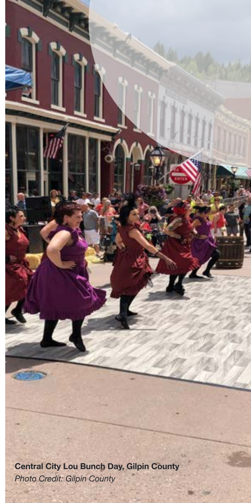
Central City Lou Bunch Day, Gilpin County

Investments in infrastructure allow new and existing businesses to thrive and prosper. (CEDS, Denver Regional Council of Governments, 2024, p. 26)