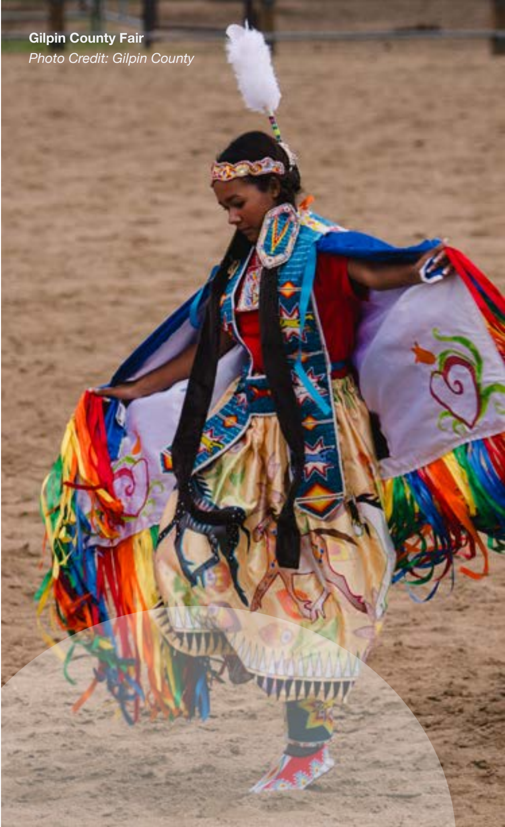
Gilpin County Fair