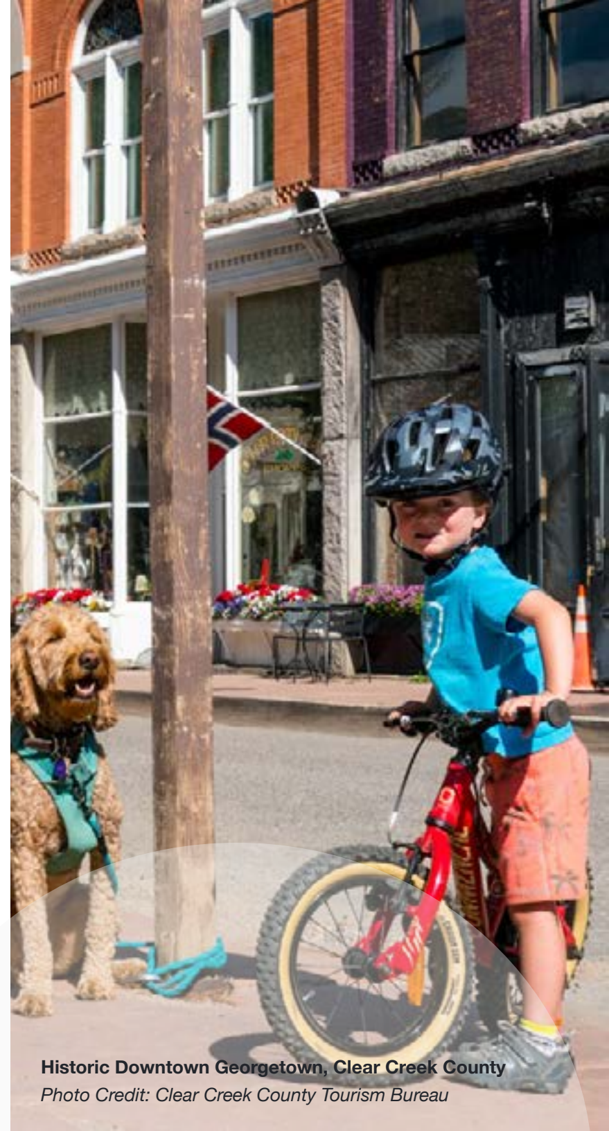
Historic Downtown Georgetown, Clear Creek County