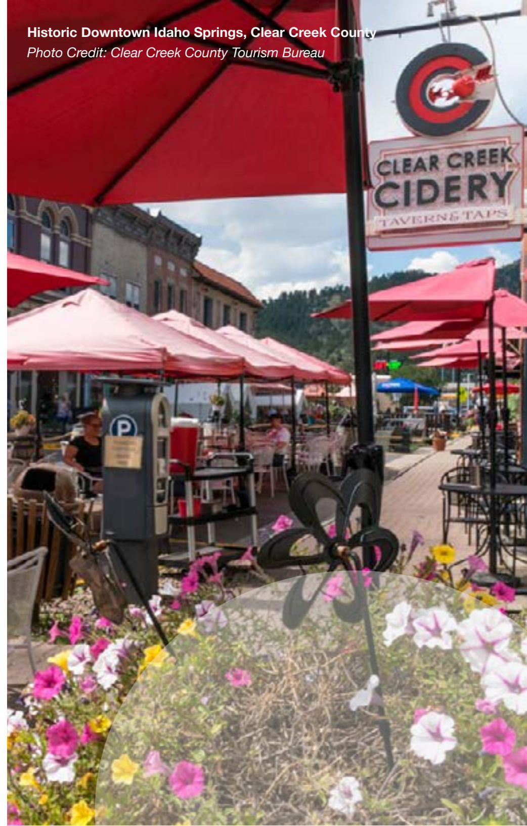
Historic Downtown Idaho Springs, Clear Creek County