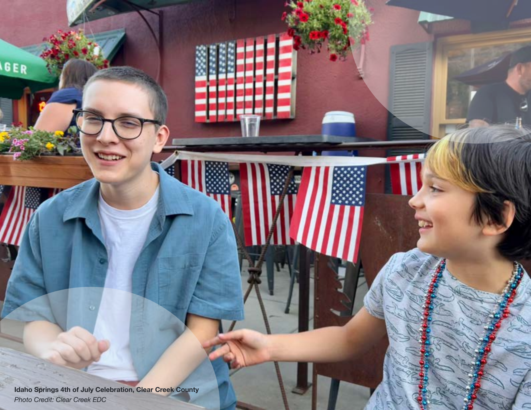
Idaho Springs 4th of July Celebration, Clear Creek County